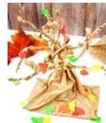
Easy Fall Tree Paper-Bag Crafts